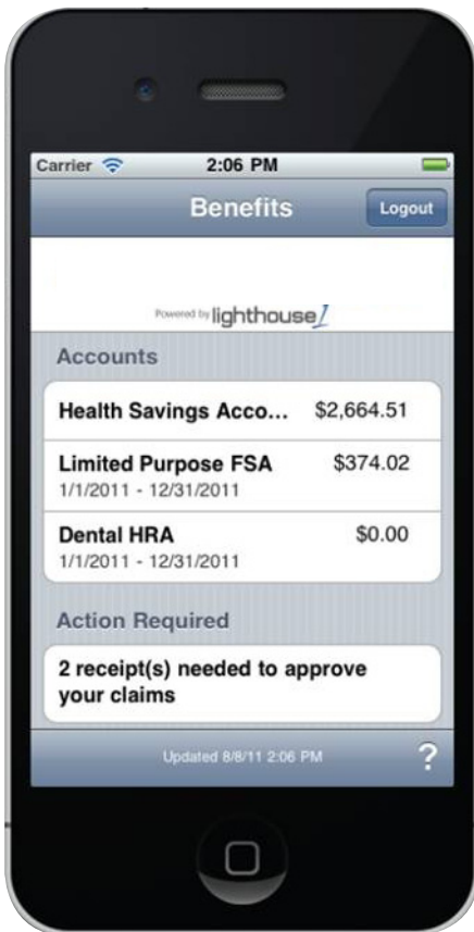
Select Action Required