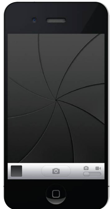
Take Picture of Receipt & Submit

The 'Benefits by BASIC' app is available on iPhone and Android phones.